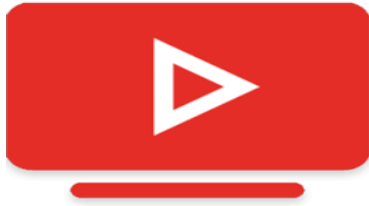
SmartTube YouTube Logo